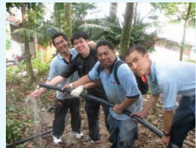
Figure 2: The pipe is important as a connector - getting closer to the destination