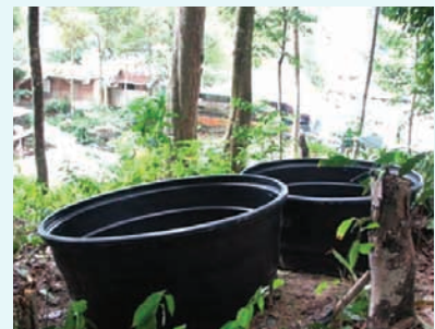
Figure 3: The two large tanks that needed to be installed