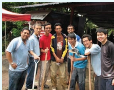
Figure 5: A photo of the crew - mission accomplished