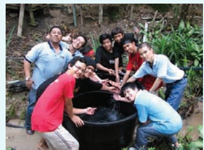
Figure 4: Finally, standing on the hilltop with the tank to store water