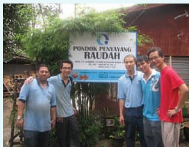
Figure 6: The place where the mission "possible" was to be